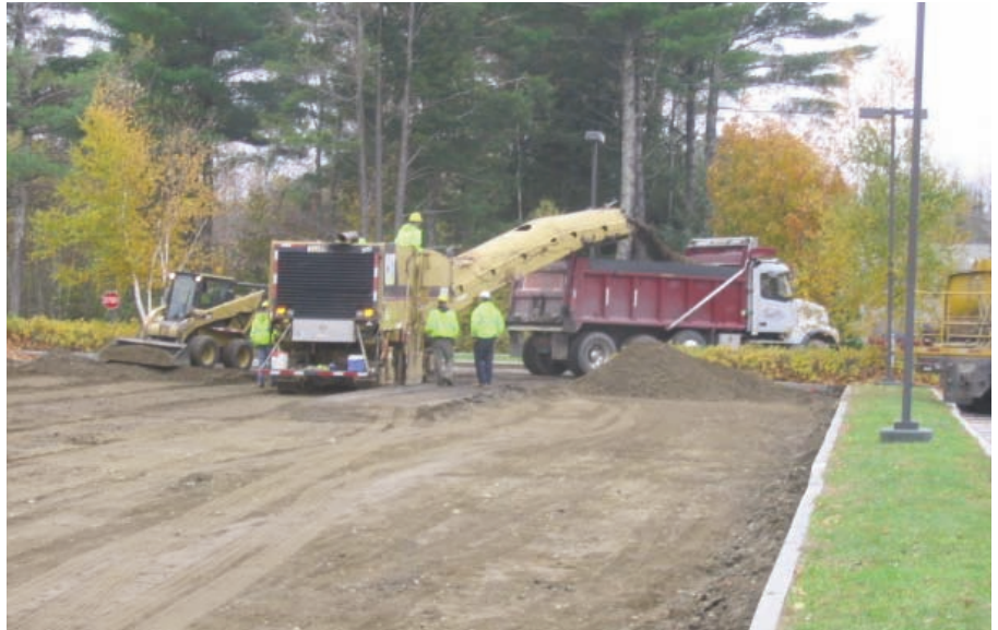
Recycling asphalt wearing surface.

After borings were completed, it was determined that a high strength structure would need to be added to help support the wheel loads. The design called for the existing asphalt surface to be removed and recycled as well as 6" to 8" of the compromised structural base course to be removed. TenCate Mirafi® RS580i* woven geotextile was to be placed on top of the remaining base course to add a higher tensile modulus and provide confinement of the base course layer. Mirafi® RS580i would also reduce pore water pressure in the base course by providing superior water flow both vertically and laterally through the fabric.