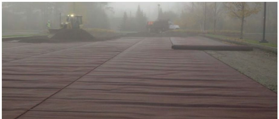
Installation of Mirafi® RS580i on soft soils in the parking area.