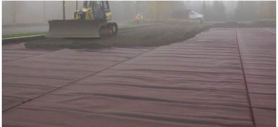
Base material being end dumped and spread on Mirafi® RS580i.

The owner's Construction Manager and the General Contractor were very satisfied with Mirafi® RS580i. The innovative, double layer geotextile has performed as expected. The project was completed in budget and within the construction time schedule.