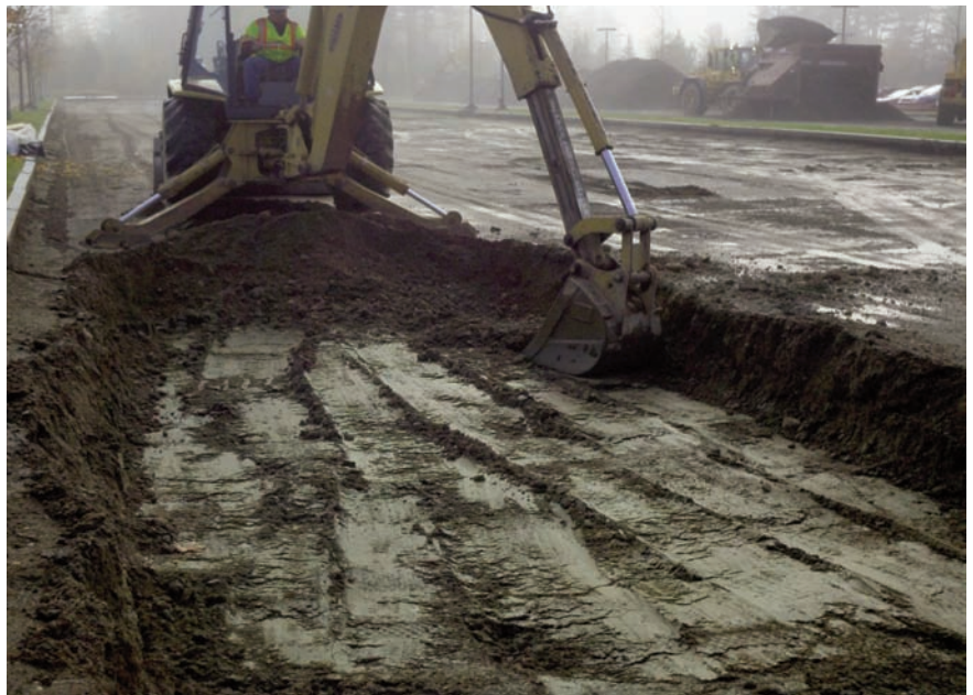
Preparation of subgrade for Mirafi® RS580i placement.